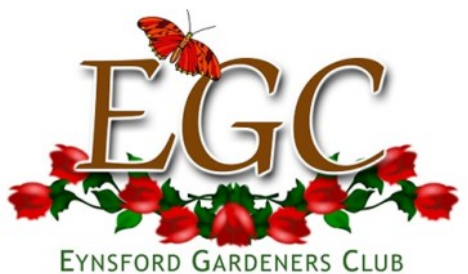
Affiliated to the RHS & KHS

Every now and again, the sun comes out, you see blue sky, gradually, just gradually, you espy some crocuses (or is it 'crocii'?) poking their little heads up